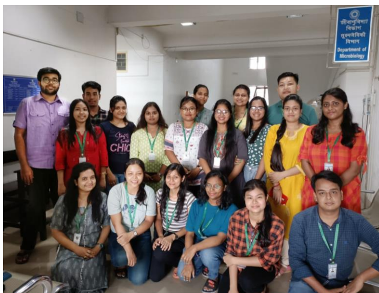
The 4 th Semester Students (2020-2022)

Often it is observed that the students working in a laboratory for their MSc project are not aware of what is being done by the other student in the neighbouring laboratory. The students of the ongoing 4 th Semester decided to bridge the gap not only within their batch but also for their juniors.